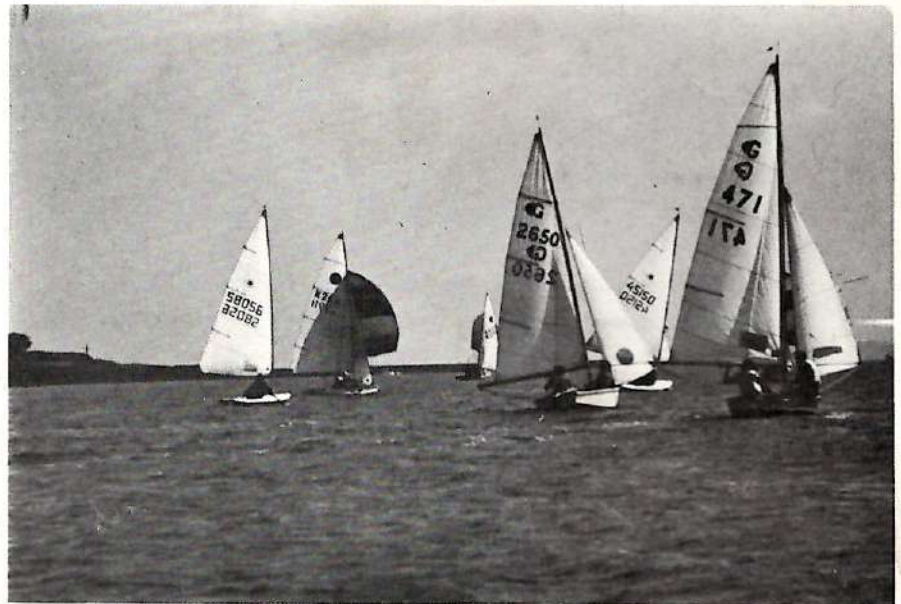
THE SOUTH KENT RACE - 1978